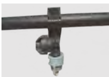
Non drip tee bodies