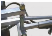
Spring loaded boom sections